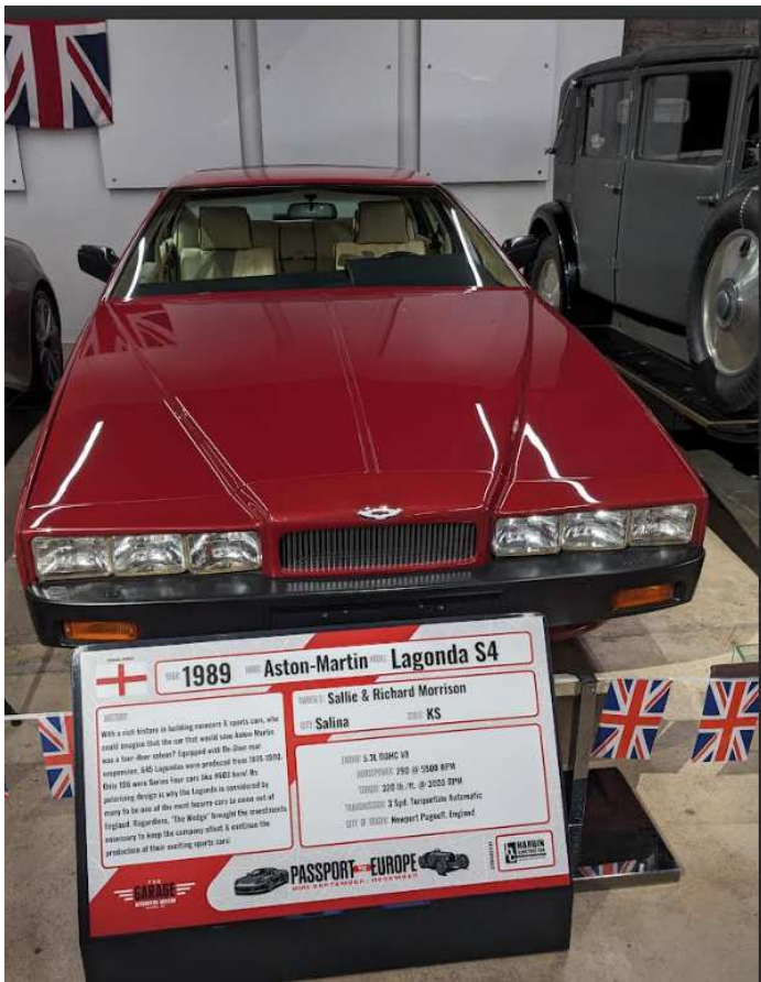
This 1989 Aston Martin Lagonda S4, the 4-door saloon, saved the company during production and 645 were built 1976 to 1990 with 5.3L DOHC V8.