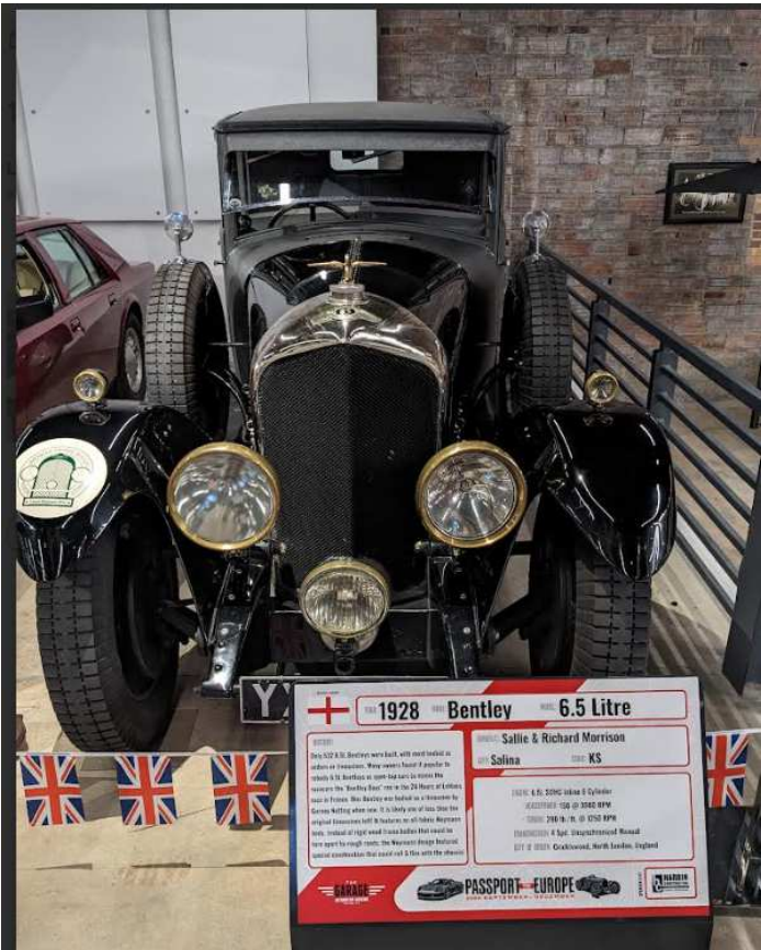
This 1928 Bentley 6.5 Litre is possibly one of less than ten originals left. Featured is Weymann body ALL of fabric to roll & flex with the chassis. This was a Gurney Nutting limousine when new.