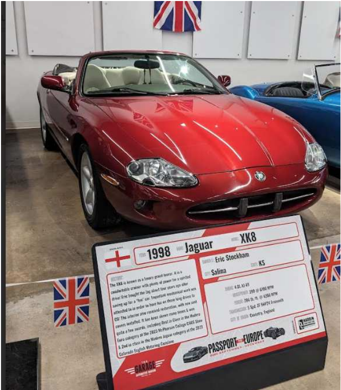
1998 Jaguar XK8 Luxury Tourer. 4.0L AJ-V8, with 290 HP 6100 RPM, 5-speed ZF 5HP24 transaxle.