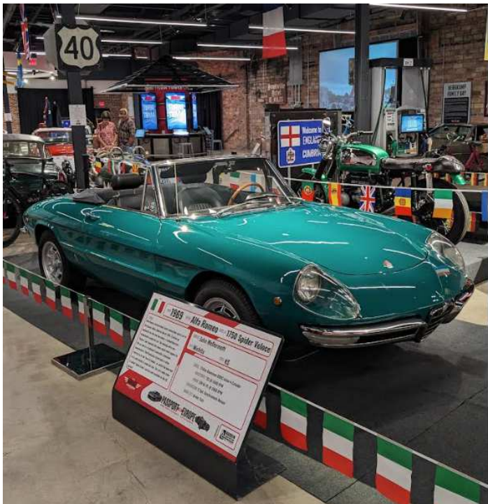
1969 Alfa Romeo 1750 Spider Veloce. Pininfarina-style body referred to as "osso di sepia" or cuttle fish bone. This "Apple Green" was a color only available in the U.S.

The Garage has Full On Driving Simulators with your choice of named Race Tracks all over!