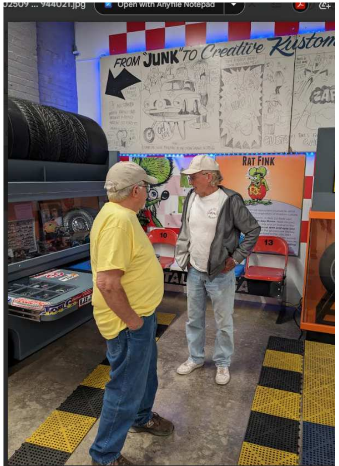
Along with everything else, the big TIRE QUIZ slot tests you on your knowledge of terms and issues dealing with tires.