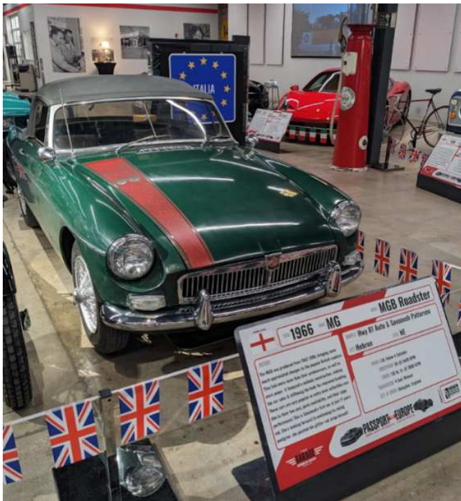
My favorite car is the MGB. This is a 1966 MGB Roadster, but nearly all of the years look the same, with exceptions of fittings and bumpers.