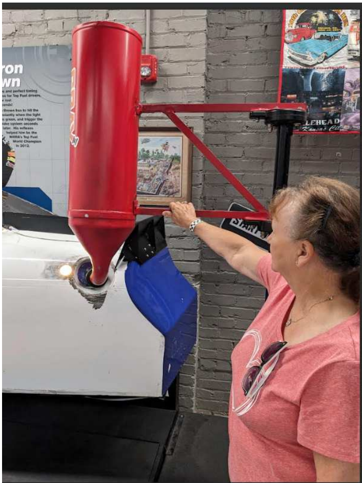
Test speed on refueling...it gurgles like real thing!