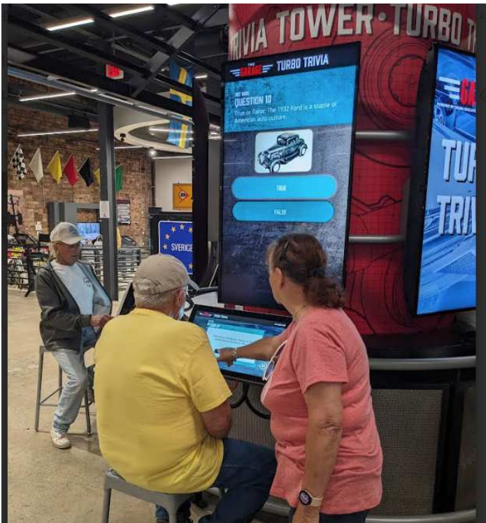
There were all sorts of kiosks with interactive quiz programs to test your car & mechanical smarts.