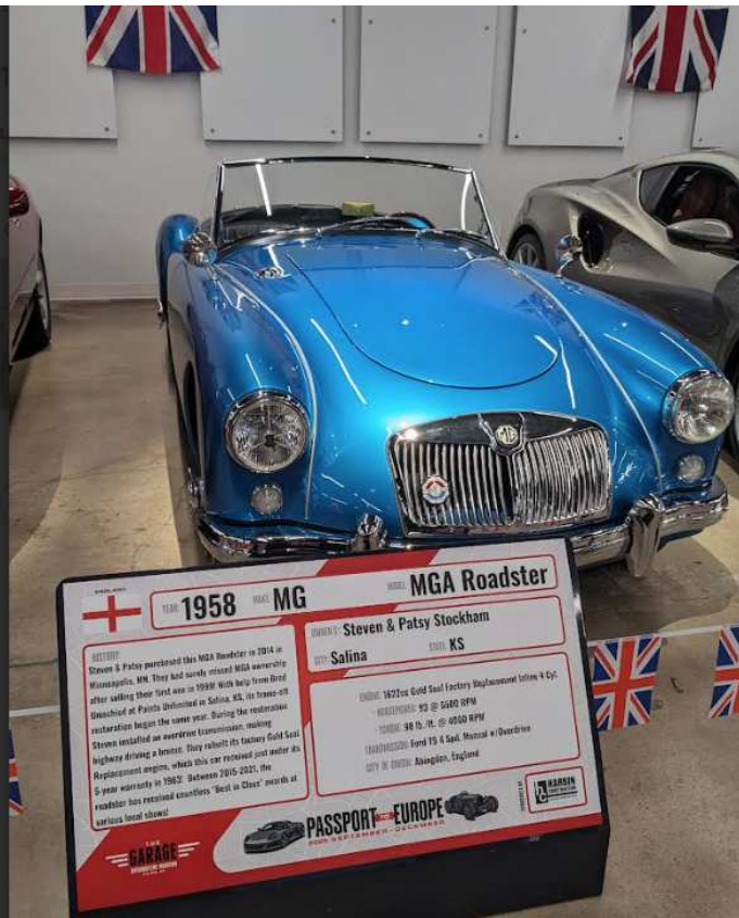
This 1058 MGA Roadster was frame-off restored, overdrive transmission installed, and got a 1622 cc Gold Seal Factory engine just under the 5-yr warranty. Transm is a Ford T9 4-speed manual.