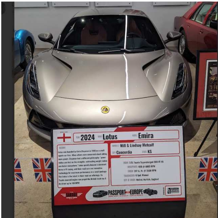
Lotus, founded by Colin Chapman, was a small sports car firm. This 2024 Lotus with a Toyota engine pushes th innovative car to 180 MPH.