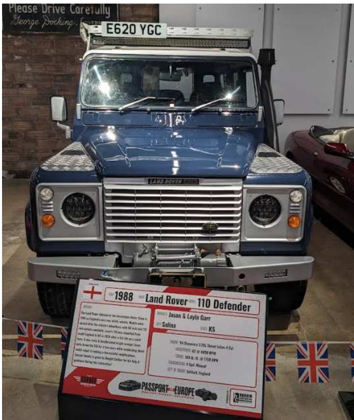
1988 Land Rover 110 Defender. The models were named after the wheelbase, 90 & 110 option Rescued from farm-painted orange, is restored!