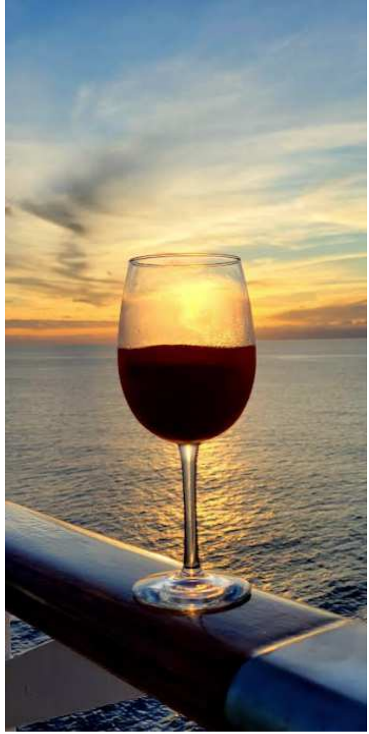
Thanks to Dan & Shirley for some ocean vacation photos that follow, and Thanks to Chuck & Teri for their Beaulieu Museum photos from across the ocean in U K starting page 4. Road Trip Anybody?