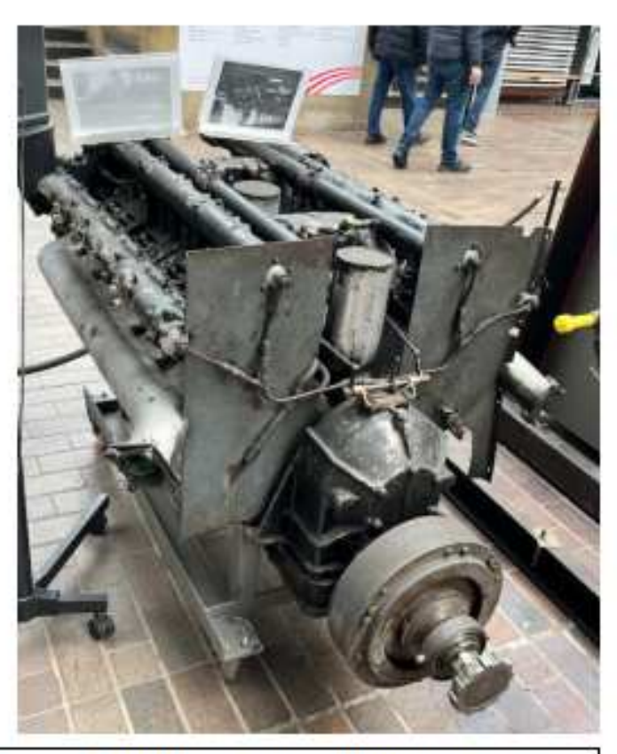
"Pieces of the Sunbeam 200-mph car from 1927. One engine is finished and the second engine is still on display."

At right is the Sunbeam Land Speed Record car that broke 150 mph in 1922. The 1000 hp Sunbeam car that broke 200 mph was also in this museum, but was under restoration.