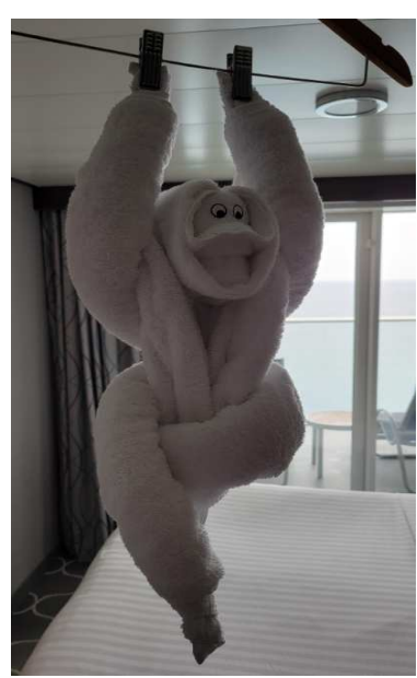
Page | 2