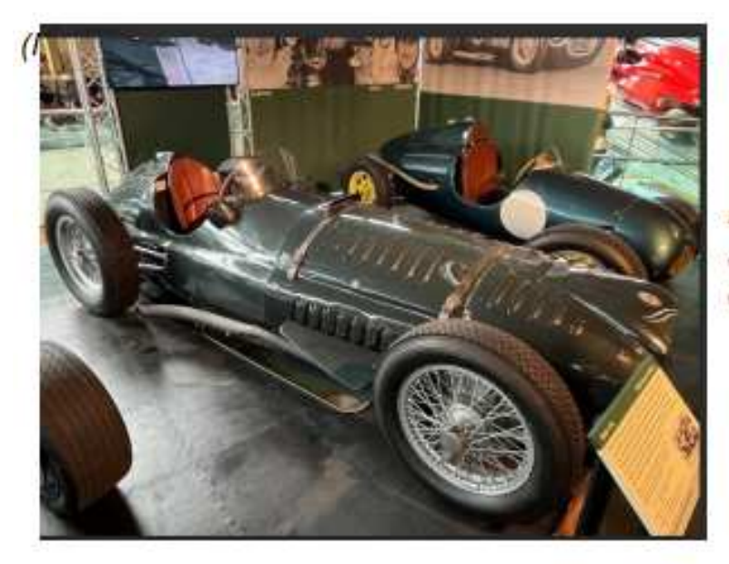
This 1950 Type 15 BRM (British Racing Motors) had a supercharger 1.5 V16 and was the first road-racing car to have disk brakes.

This is an 1894 Bremer . It is believed to be the First British 4-Wheeled Motorcar.