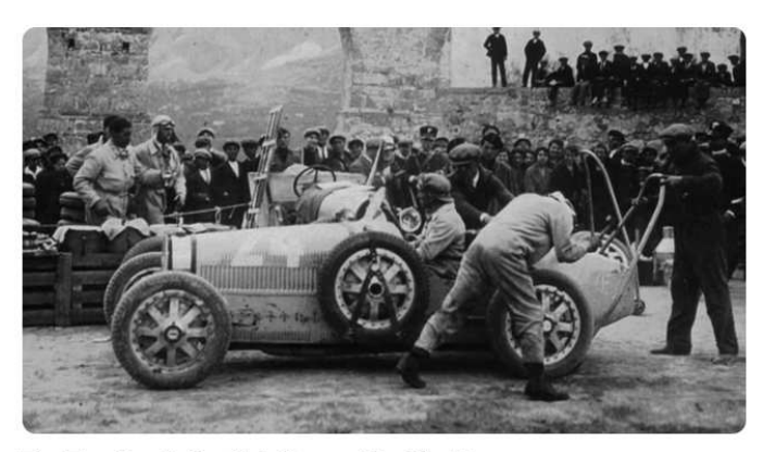
The Tiny Sports Car that Changed the World