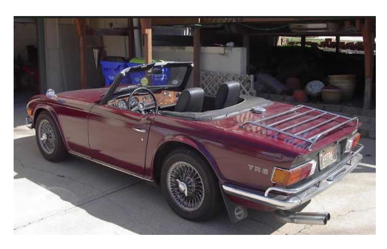
Asking $15,000 for total package

Ray Overton is selling a very interesting TR6 and a trove of parts. For those who remember Ray, you know the high degree of mechanical expertise and precision he put into this car. - Damson over Black - 22nd production TR6 VIN # CC25024 - Wire Wheels - Spare Parts Rebuilt engine, 5-speed transmission New muffler, Rear Axels & differential Driveshaft, Lots more small parts