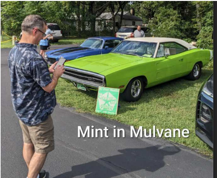
Mint in Mulvane